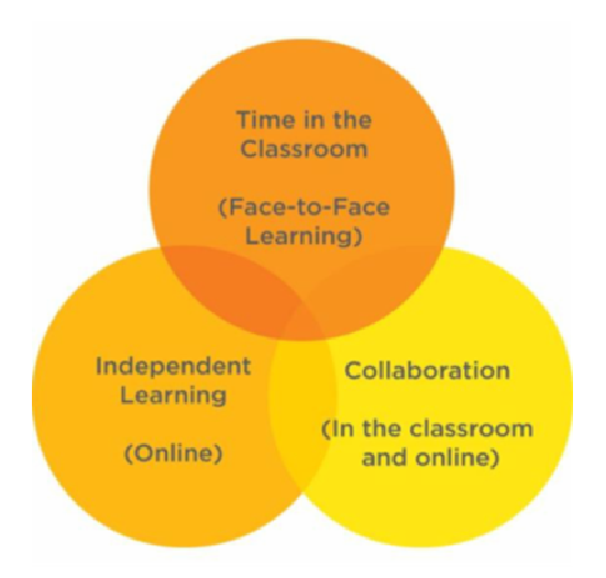
Figure 2.1. Blanded Learing Concept

IJOLTZ (2019),4(3): 173-186. DOI: <a href="https://doi.org/10.30957/ijoltl.v4i3.608">https://doi.org/10.30957/ijoltl.v4i3.608</a>